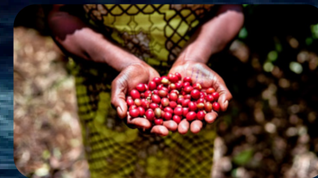
Consistent Quality Control

We work closely with local farmers, supporting sustainable farming methods and empowering rural communities through fair trade and skill development.