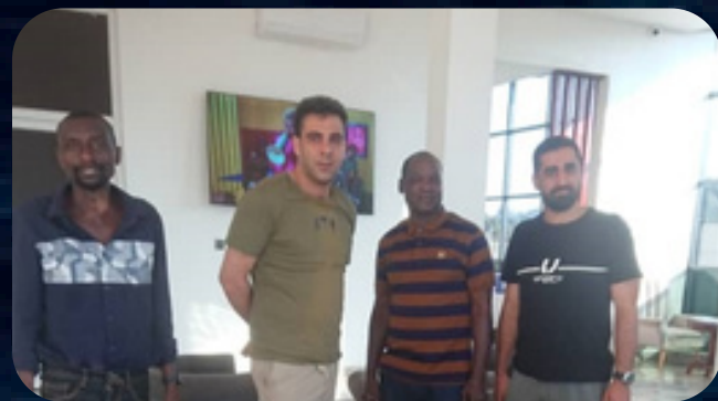
Trusted and Transparent