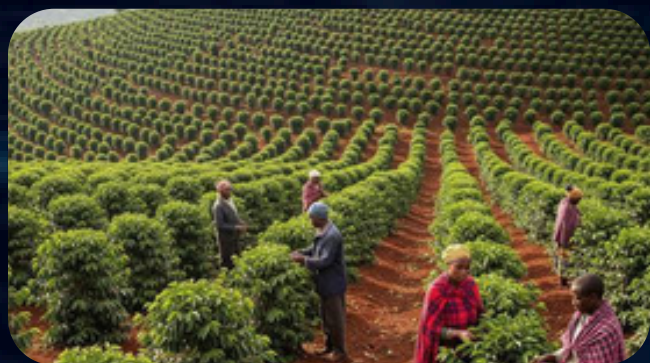
Premium Quality from the Source

We operate with honesty and integrity, we value long-term relationships whether you're a small roaster, exporter, or café owner, we can tailor supply arrangements.