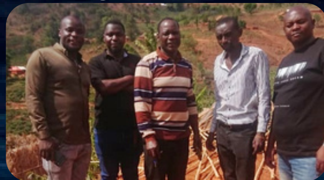
Sustainable and Community-Focused